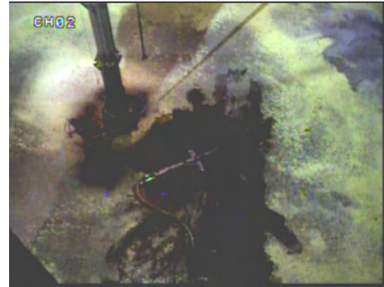
Tank 18 start 1/30/09