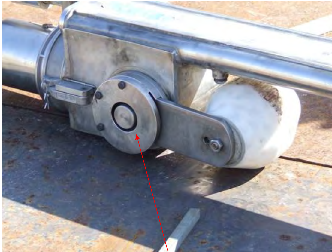
Tank 18 Sand Mantis Retaining Cover