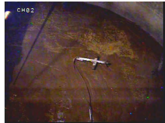
Tank 18 on 2/17/09