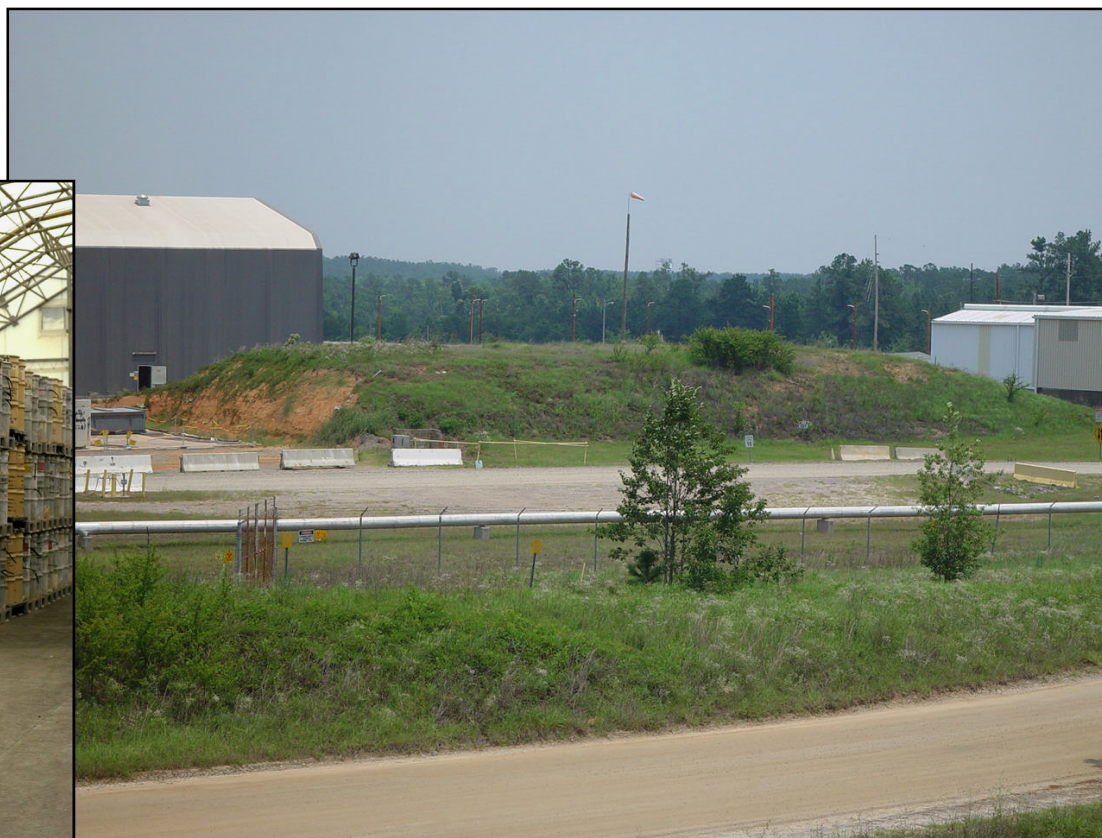
TRU Pad 1