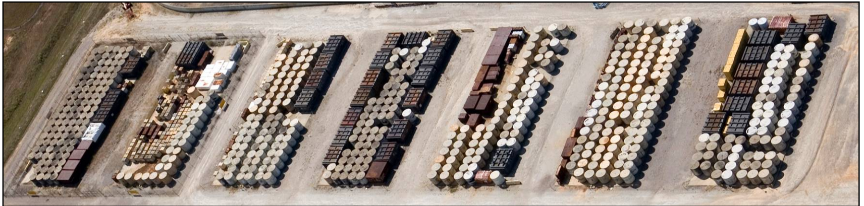
SRS TRU Pads 7 – 13 September, 2006 700+ Containers