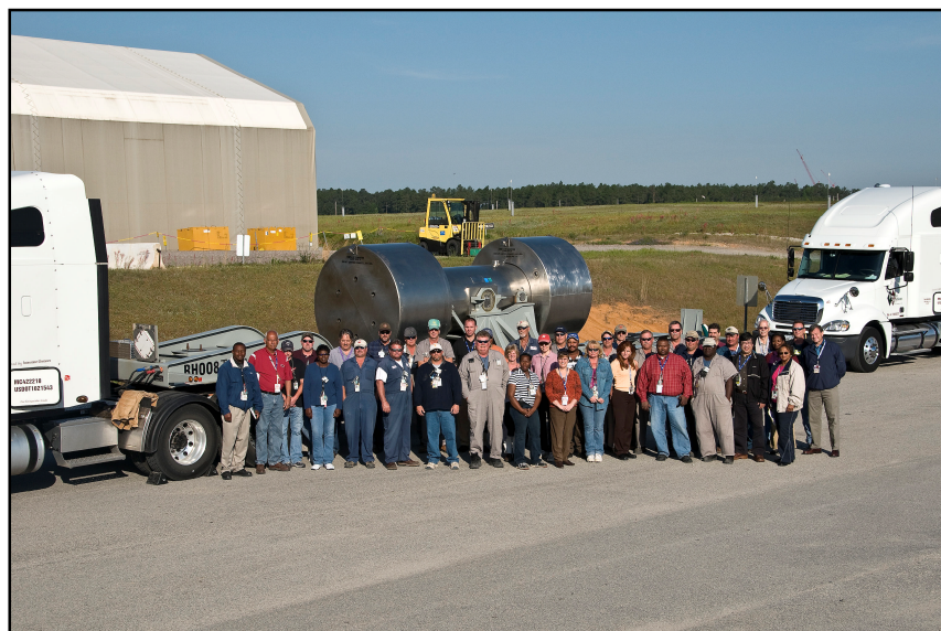
Solid Waste Management RH Shipment Team