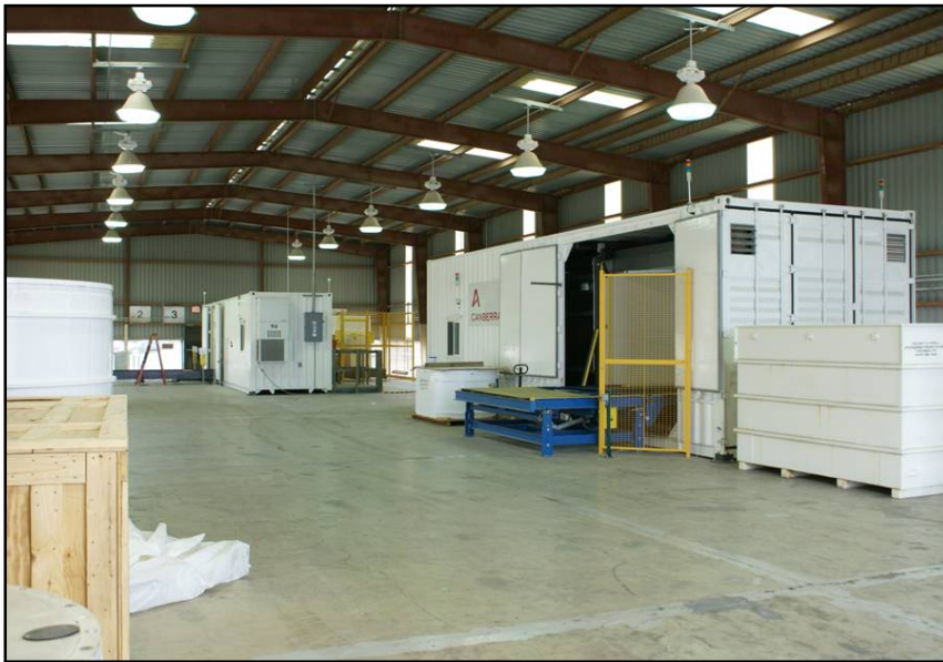
Large Box NDA Unit