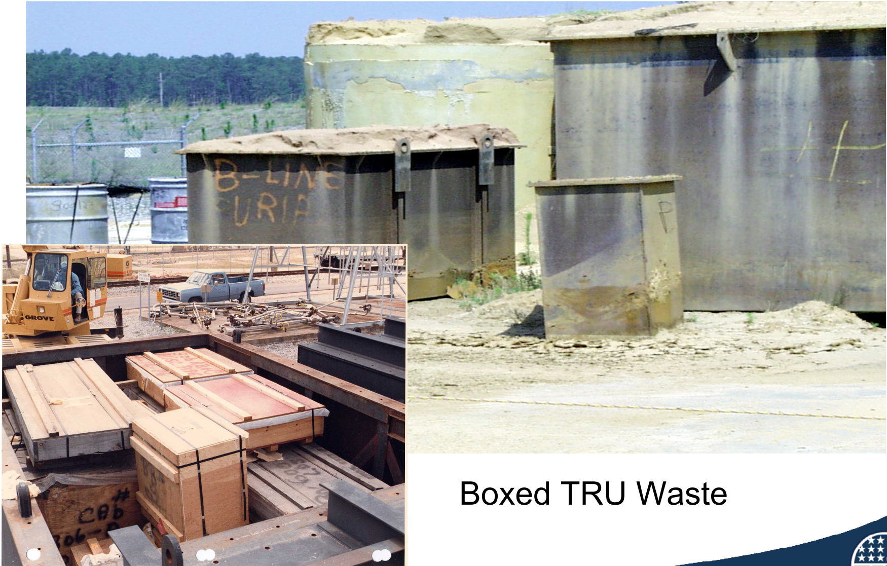
Boxed TRU Waste