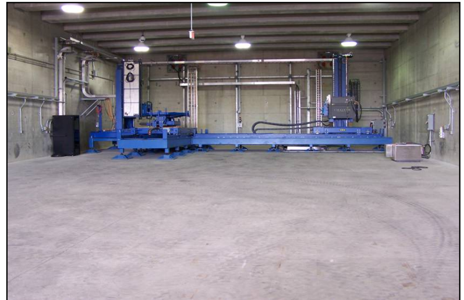
Large Box NDE Unit