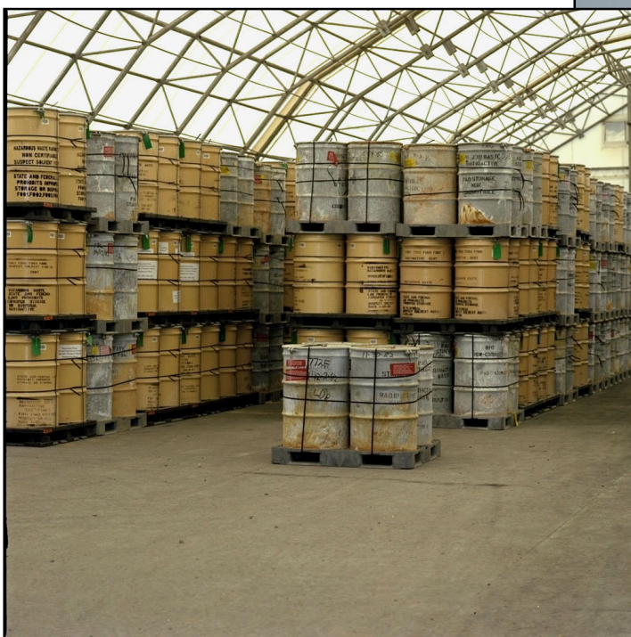
Drums in Storage