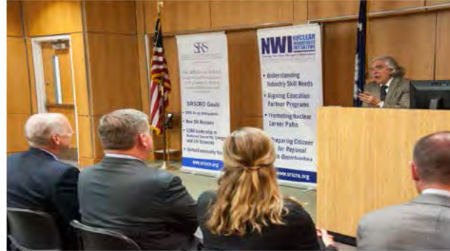
Secretary Moniz Reception