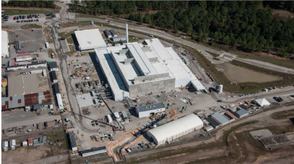
Salt Waste Processing Facility (SWPF) Project