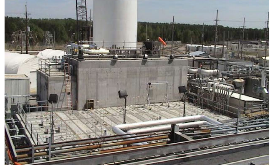
Modular Caustic Solvent Extraction Unit (MCU)