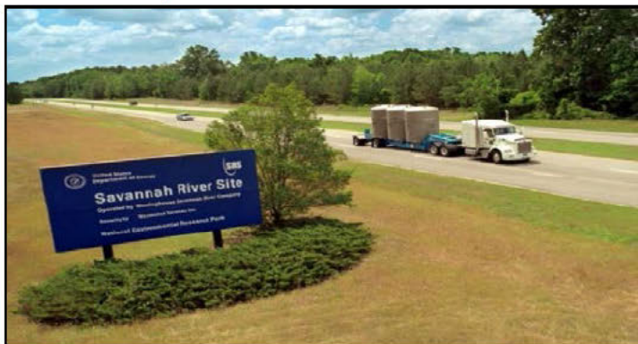
Waste Isolation Pilot Plant Shipment

To provide potential topics for the Waste Management Committee for use in development of their 2014 Work Plan.