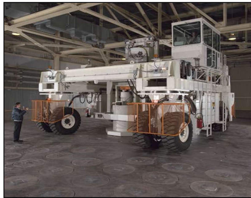
Glass Waste Storage