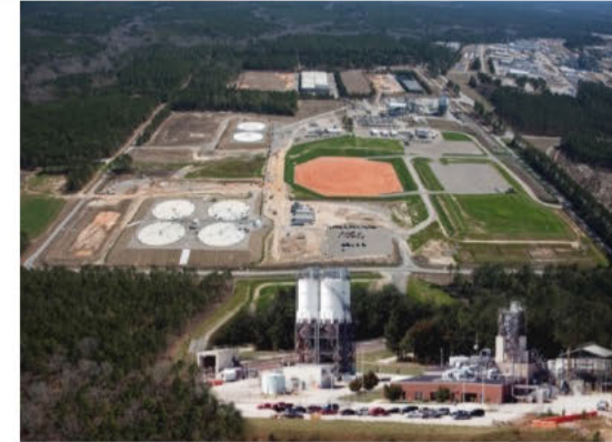
Saltstone Disposal Unit 6