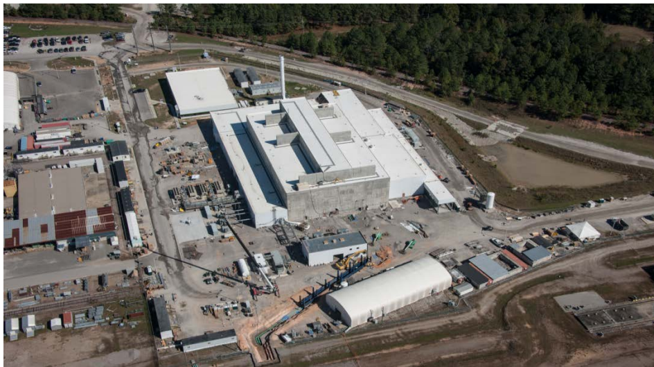
Salt Waste Processing Facility (SWPF) Project