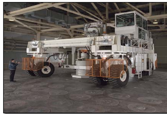
Glass Waste Storage