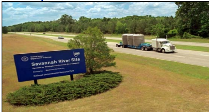
Waste Isolation Pilot Plant Shipment

To provide potential topics for the Waste Management Committee for use in development of their 2017 Work Plan.