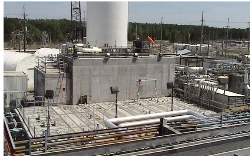
Modular Caustic Side Solvent Extraction Unit (MCU)