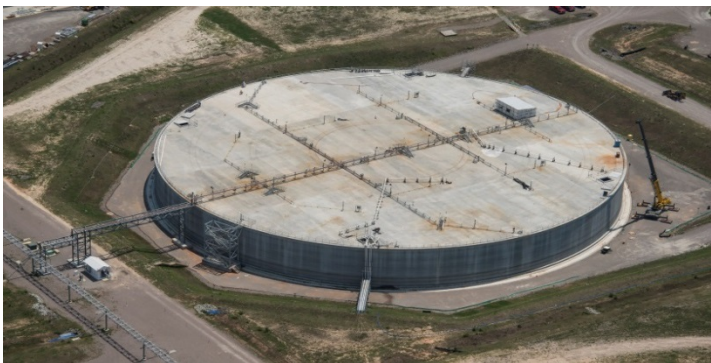
Saltstone Disposal Unit 6